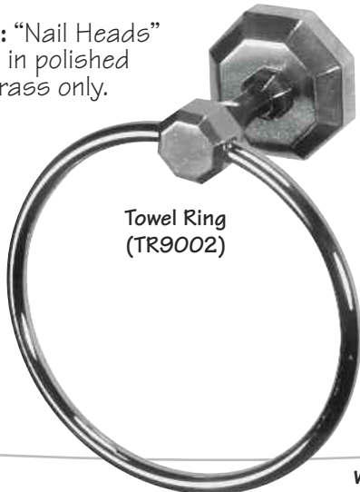
Towel Ring (TR9002)