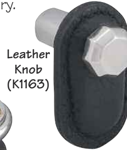
Leather Knob (K1163)