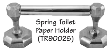
Spring Toilet Paper Holder (TR90025)