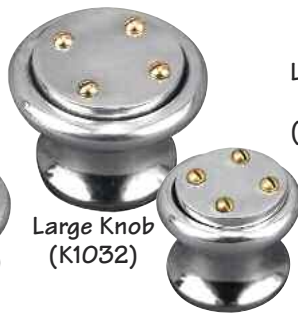
Large Knob (K1032)