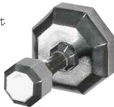
Robe Hook (P09002)

NOTE: "Nail Heads" are in polished brass only.