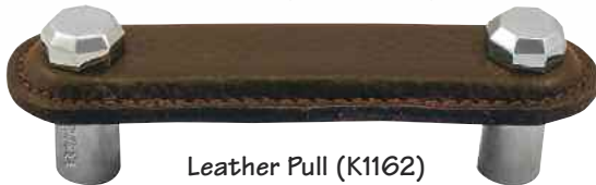
Leather Pull (K1162) Available in four sizes (3, 4, 5 & 6")