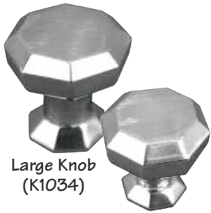
Large Knob (K1034)

Archimedes is considered to be the greatest mathematician of antiquity and one of the greatest of all time. He gave a remarkably accurate approximation of pi. An inventor, physicist, astronomer and engineer archimedes was born in Sicily in 287 B.C. Therefore, the smooth, octagonal, double circle and nail head design fit well into the Vicenza Designs' Archimedes line of fine cabinet jewelry.