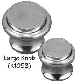
Large Knob (K1053)