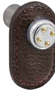
Leather Knob (K1159)