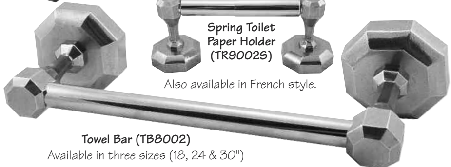
Towel Bar (TB8002) Available in three sizes (18, 24 & 30")