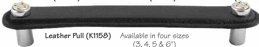
Leather Pull (K1158) Available in four sizes (3, 4, 5 & 6")