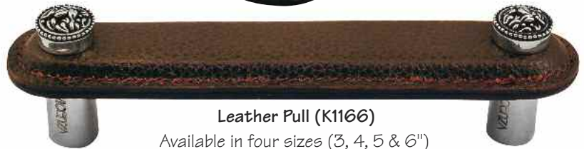
Leather Pull (K1166)