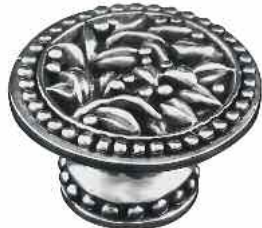
Large Knob with Small Base (K1001P)