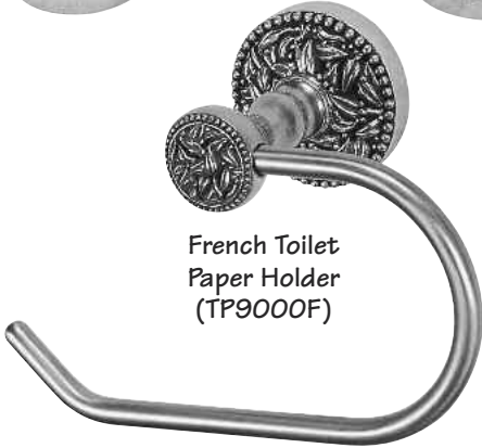
French Toilet Paper Holder (TP9000F)