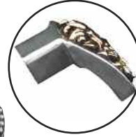
Finger Pull Knob (K1250)