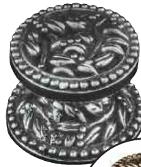
Small Knob (K1002)