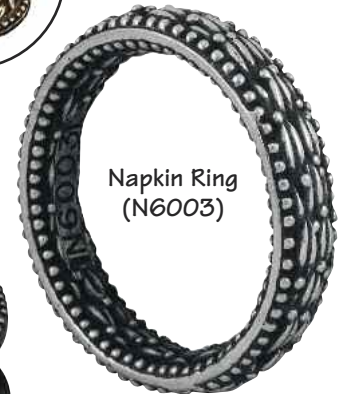
Napkin Ring (N6003)