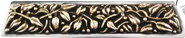
Finger Pull (P1250)