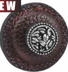
Round Leather Knob (K1283)