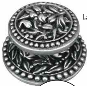
Large Knob (K1001)