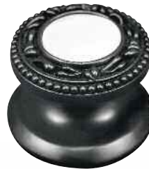
Small Knob With Stone (K1149)