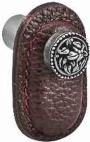
Leather Knob (K1167)