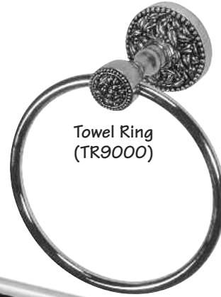
Towel Ring (TR9000)