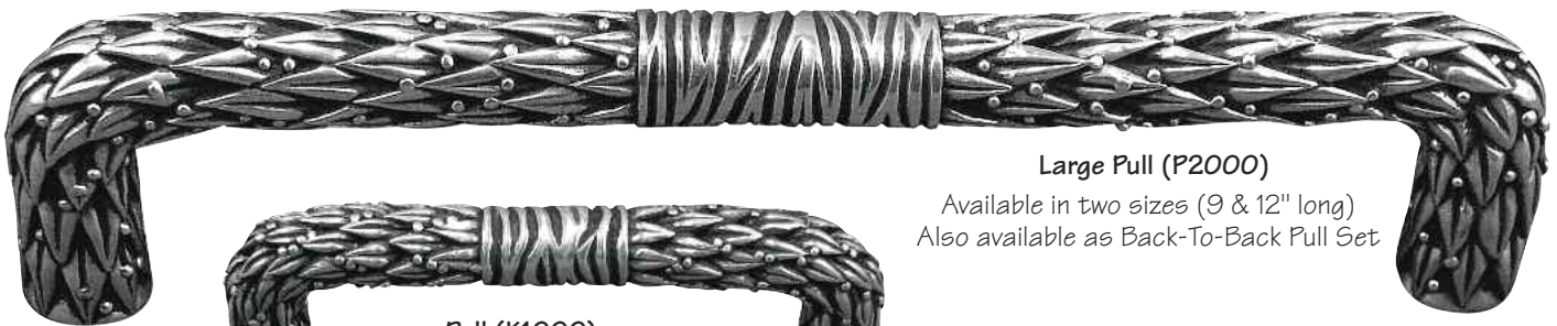
Large Pull (P2000)

Available in two sizes (9 & 12" long) Also available as Back-To-Back Pull Set