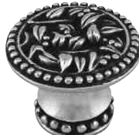
Small Knob with Small Base (K1002P)