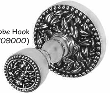
Robe Hook (P09000)