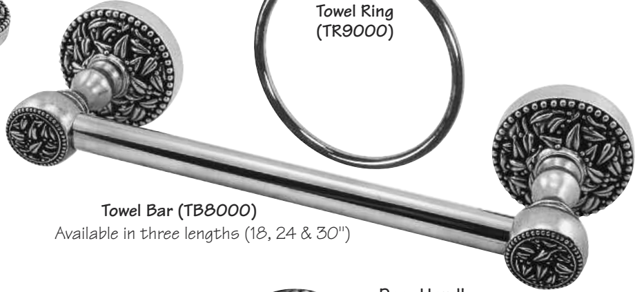
Towel Bar (TB8000) Available in three lengths (18, 24 & 30")