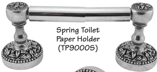
Spring Toilet Paper Holder (TP9000S)