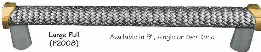
Large Pull (P2008)