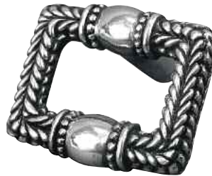
Large Knob (K1070)