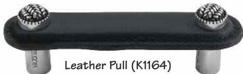
Leather Pull (K1164)