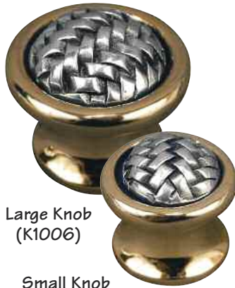
Large Knob (K1006)