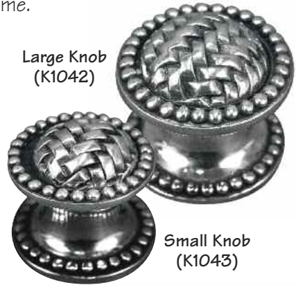
Large Knob (K1042)