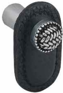
Leather Knob (K1165)