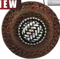
Round Leather Knob (K1279)