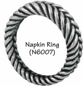
Napkin Ring (N6007)