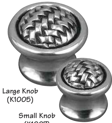
Large Knob (K1005)

Meaning basket, cestino weaving is a design staple in Italy from handbags to ceramic tile and tapestry to breads. The 100% lead-free pewter Cestino (basketweave) doorbell, door handles, knobs, pulls, napkin rings and bathroom accessories will add a sense of Italian country charm to your home.