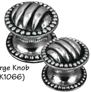
Large Knob (K1066)