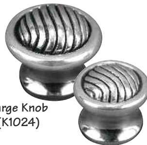
Large Knob (K1024)