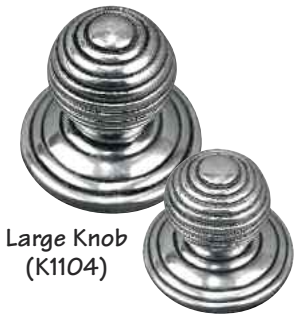
Large Knob (K1104)