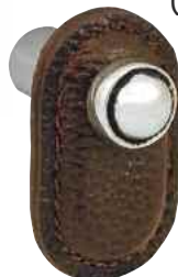
Leather Knob (K1169)