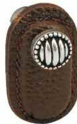
Leather Knob (K1171)