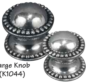
Large Knob (K1044)