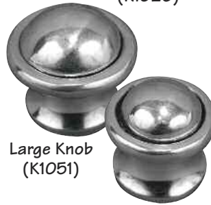
Large Knob (K1051)