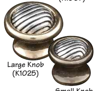
Large Knob (K1025)