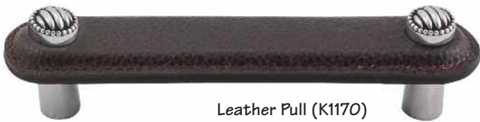
Leather Pull (K1170)