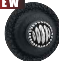
Round Leather Knob (K1280)