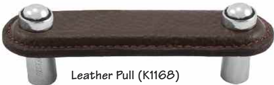
Leather Pull (K1168)