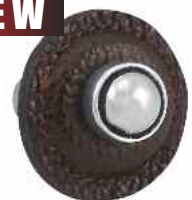
Round Leather Knob (K1287)