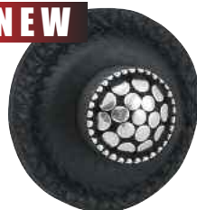
Round Leather Knob (K1285)