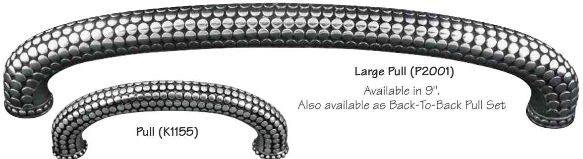
Large Pull (P2001)