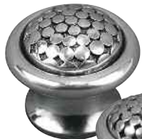
Large Knob (K1036)