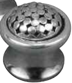
Small Knob (K1037)