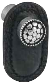
Leather Knob (K1161)