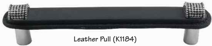
Leather Pull (K1184)