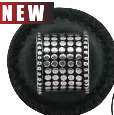
Round Leather Knob (K1277)