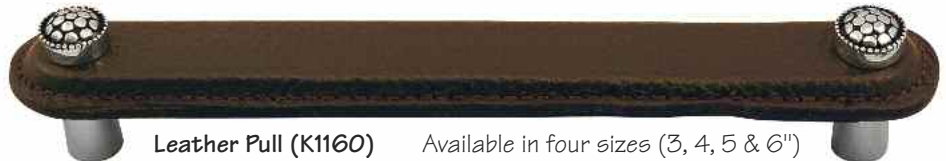
Leather Pull (K1160)