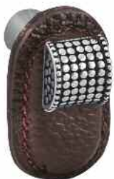
Leather Knob (K1185)