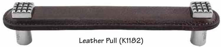
Leather Pull (K1182)