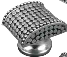
Large Knob (K1154)