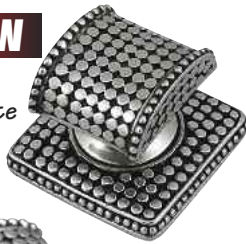
Large Knob With Backplate (K1256)