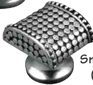
Small Knob (K1153)