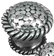
Large Knob (K1040)