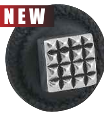
Round Leather Knob (K1275)