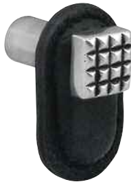
Leather Knob (K1183)