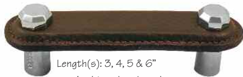
Length(s): 3, 4, 5 & 6"