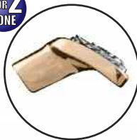
Liscio, Leaves P1251 Length(s): 3"