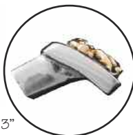
San Michele P1250 Length(s): 3"