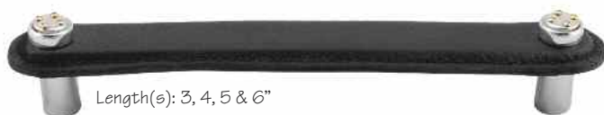
Length(s): 3, 4, 5 & 6"