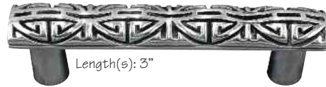
Length(s): 3" Camesana K1124