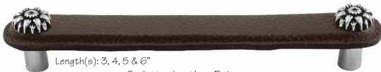
Length(s): 3, 4, 5 & 6" Carlotta, Leather, Daisy K1180