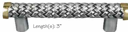
Length(s): 3" Cestino, Two-Tone K1004