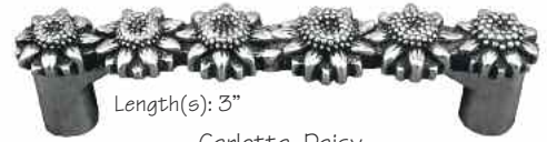
Length(s): 3" Carlotta, Daisy K1081