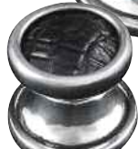
Small Knob (K1111)