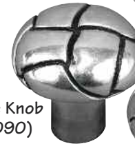
Large Knob (K1090)