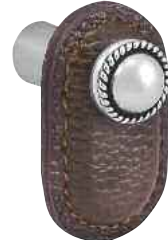
Leather Knob (K1173)