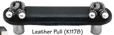
Leather Pull (K1178)