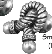
Small Knob (K1021)