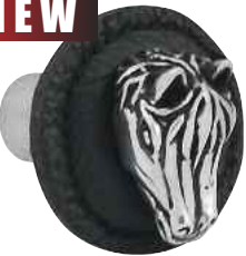
Round Leather Knob (K1273)