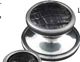
Large Knob (K1110)