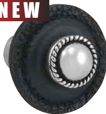
Round Leather Knob (K1282)