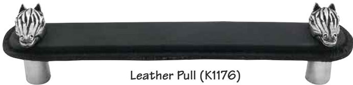
Leather Pull (K1176)