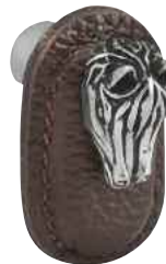
Leather Knob (K1177)