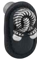
Leather Knob (K1179)