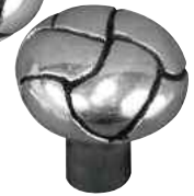
Small Knob (K1091)