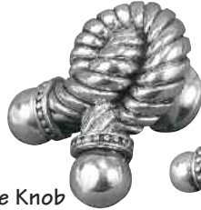
Large Knob (K1020)