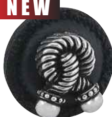
Round Leather Knob (K1272)