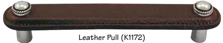
Leather Pull (K1172)