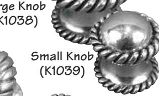
Large Knob (K1038)