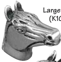
Large Knob (K1017)

Equestrian or horse races have long been a tradition in Italy. The Palio di Siena located in Siena, Italy, got its modern start in 1656. Vicenza Designs' Equestre line allows you to express your passion for horses in your home in a unique way.