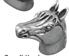
Small Knob (K1018)