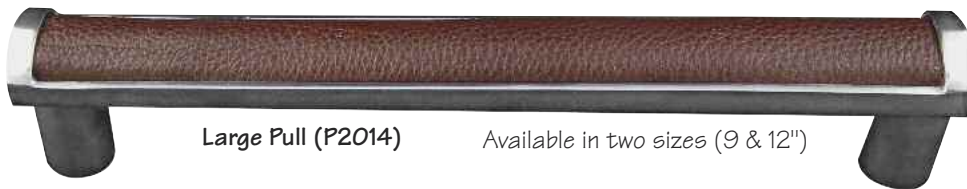
Large Pull (P2014)